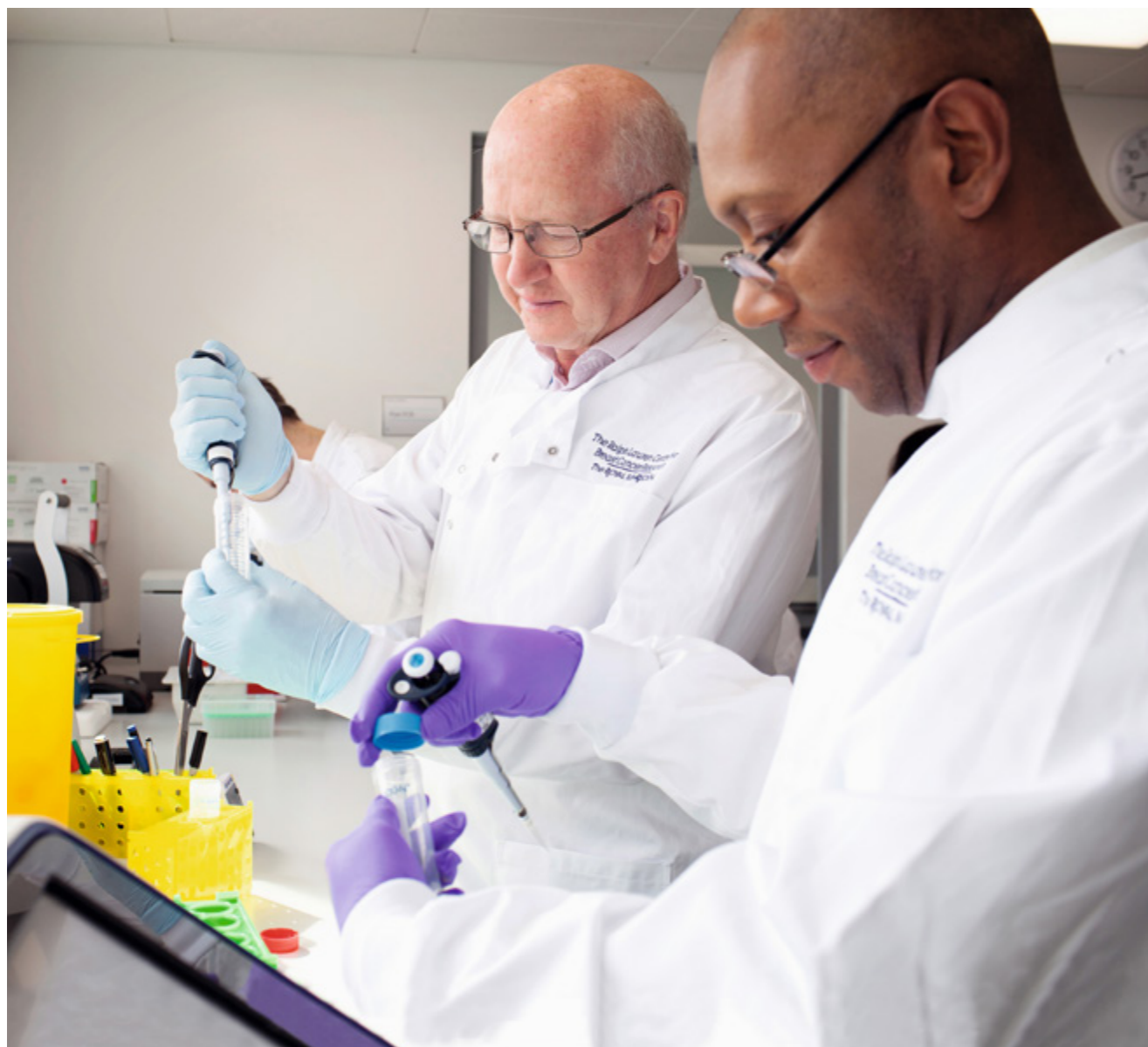
Researchers in the Ralph Lauren Centre for Breast Cancer Research

Together with its academic partner, The Institute of Cancer Research (ICR), The Royal Marsden is the largest and most comprehensive cancer centre in Europe. It is a centre of excellence with an international reputation for groundbreaking research and pioneering the latest in cancer treatments and technologies, as well as specialising in cancer diagnosis and education.