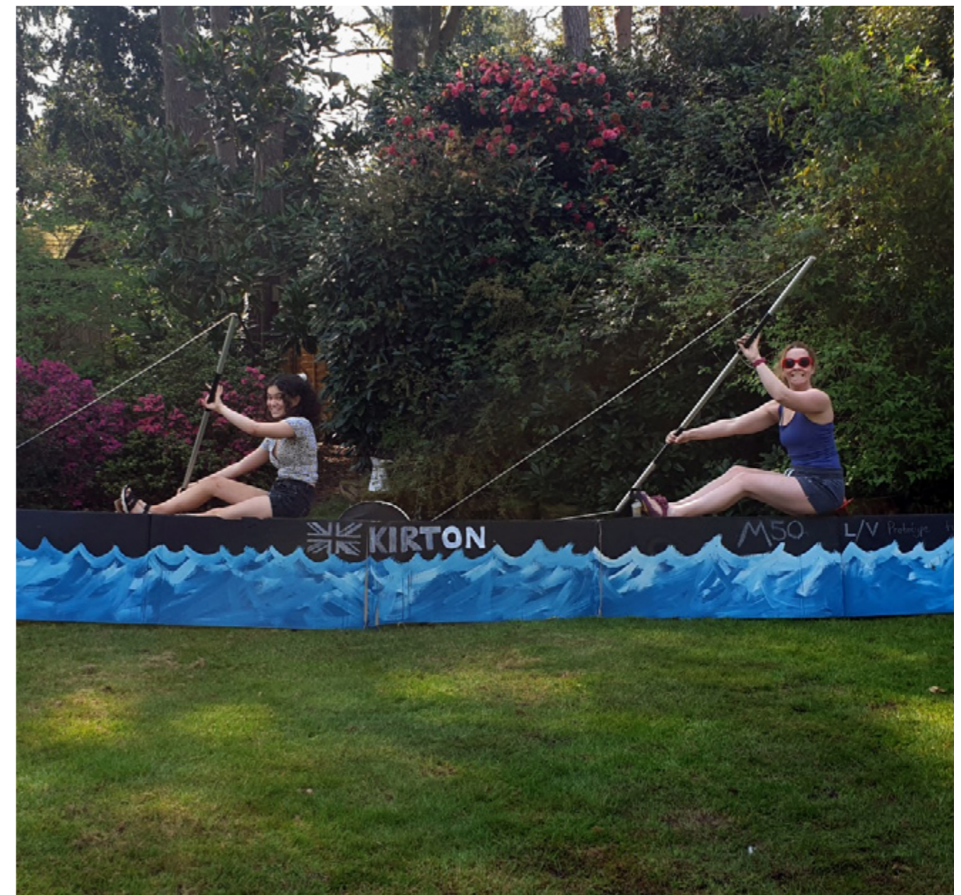
A mother and daughter team taking on a lockdown canoe race in their back garden

The Royal Marsden Cancer Charity takes careful steps to ensure that we protect vulnerable people and other members of the public from behaviour that may be seen as unreasonable. In line with the Fundraising Code of Practice and Institute of Fundraising guidance Treating Donors Fairly – Fundraising with People in Vulnerable Circumstances, the Charity has a clear Fundraising and Vulnerable Circumstances Policy in place. This is a key part of the induction and training process for all staff and is reviewed regularly. Managers are responsible for ensuring that their teams are aware of this Policy and understand the information within it.